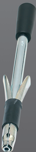
5 mm 52-300-5