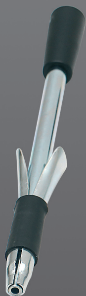
4 mm 52-300-4